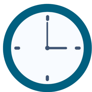
TIME TO PUMP