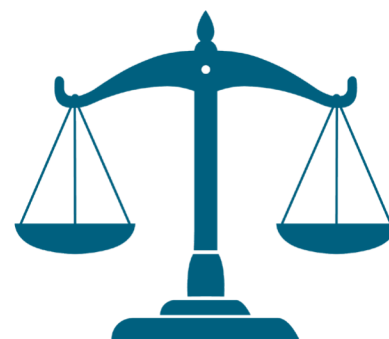
PROTECTED BY LAW